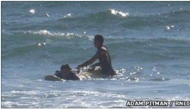
ADAM PITMAN / RNLI of Freshwater West's lifeguards helping one of the rip current victims to safety

A warning has been issued about the dangers of straying outside marked safe areas of the sea after six people were caught in rip currents.